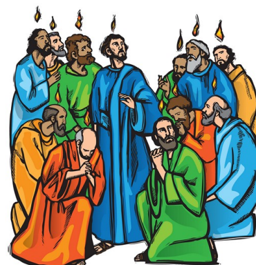
The Holy Spirit Descends on Pentecost