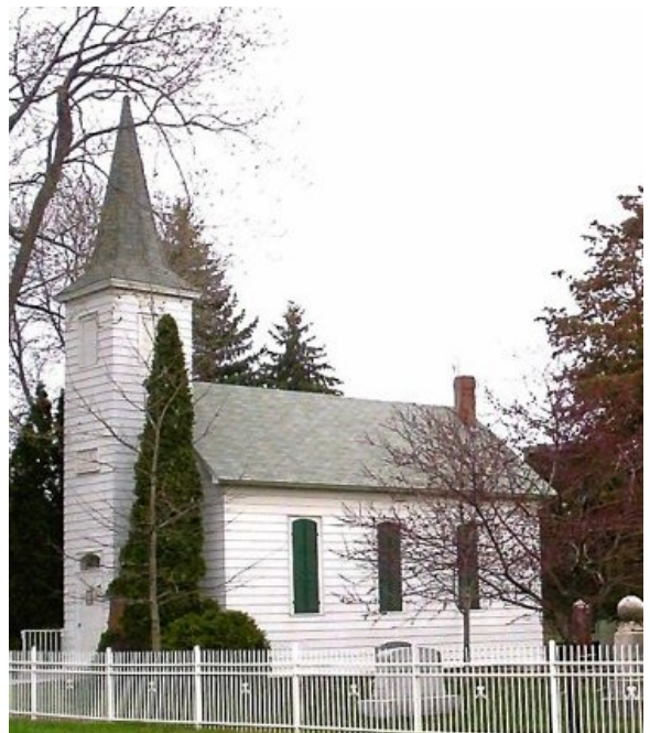
Old Salem Shrine is located at Upper 55th Street East and Annette Avenue East in Inver Grove Heights.