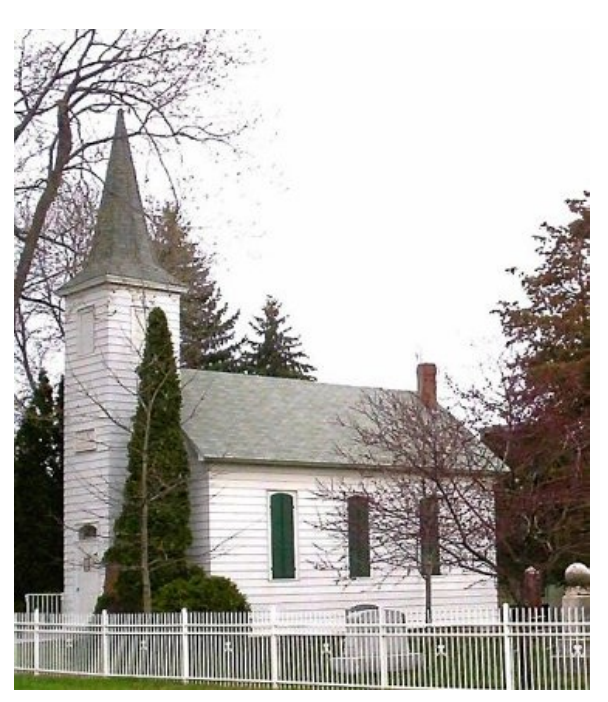
Old Salem Shrine is located at Upper 55th Street East and Annette Avenue East in Inver Grove Heights.

FAITH IN ACTION is published monthly by Faith United Methodist Church, 1530 Oakdale Ave., West St. Paul MN 55118 (651) 457-5686 office; Email: faithumc@usfamily.net DEADLINE: the 15th of each month, unless otherwise noted. Editor reserves the right to edit for content and space. <u>Visit us at www.faithumcmn.com</u>