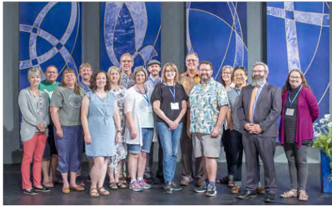
The incoming and outgoing cohorts of the Nonprofit Church Leadership Program (note: more participated from home via Zoom).